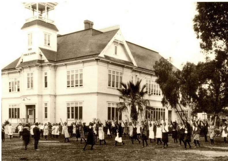
Bailey Street School the Home of WHS 1900-1905